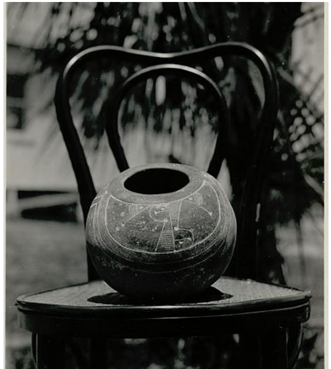
Photo of a pot found by Fewkes at Weedon Island

special connection. Looking forward to seeing this on some CGCAS tshirts soon!