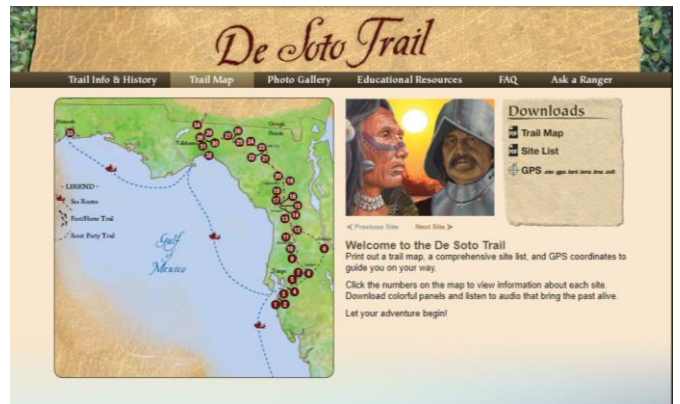
De Soto Trail Website

Interested in learning more about De Soto’s path across Florida? Be sure to check out the De Soto Trail website for information on places you can visit today! More info at this link: http://www.floridadesototrail.com/