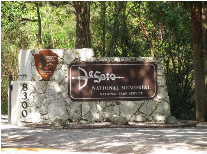
De Soto National Memorial in Bradenton

A unique driving trail now follows this first year of Hernando de Soto's historic expedition through Florida's Native American territories. Easily accessed by motorized vehicle, the De Soto Trail connects 34 sites of cultural, environmental, or historic interest. Each is marked by a kiosk, offering a glimpse back in time to a land of long ago. Brochures, complete with trail map and GPS coordinates, are available at each kiosk.”