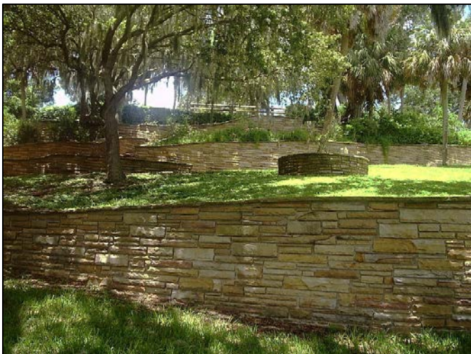
View of the back side of the Safety Harbor mound at Philippe Park.

As I mentioned above, not only is Philippe Park beautiful, it is also home to an important archaeological site. The Safety Harbor Site was declared a National Historic Landmark in 1964, and was listed on the National Register of Historic Places in 1966. The site is made up of a large temple mound, one smaller burial mound and two shell middens. The temple mound is located right next to the water and provides a beautiful view of Tampa Bay from the top. This should be a great picnic so hope to see you all there!