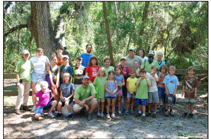
CGCAS members and Junior Archaeologist campers out in the field at the Weedon Island Preserve.

Registration is now open for two Junior Archaeologist Summer Camps scheduled for this July at the Weedon Island Preserve. The Alliance for Weedon Island Archaeological Research and Education (AWIARE), the Florida Public Archaeology Network (FPAN), and CGCAS will be teaming up again this year to put on the camps. Last year's camps were a huge hit with the kids, and we are hoping for another successful summer!