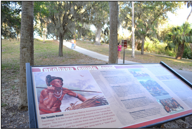
View of the Safety Harbor mound at Philippe Park.

coming fiscal year, and newcomers are always welcome!