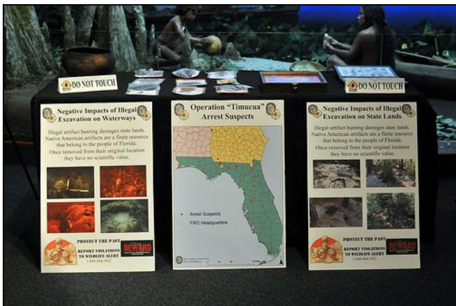
Information and artifacts on display at the FWC "Operation Timucua" press conference.

On February 27, I attended the press conference in Tallahassee where the Florida Fish and Wildlife Commission (FWC) announced the details of a 2 year undercover operation titled "Operation Timucua", and the subsequent arrests of 14 individuals in Florida and Georgia. FWC alleges that the individuals targeted in the sting were involved in the illegal taking of prehistoric and historic artifacts from protected State lands and sovereign State waters and in the extensive dealing of that stolen property. Operation Timucua resulted in over 400 criminal charges; both felony and misdemeanor counts. Florida Secretary of State Ken Detzner, FWC representatives, and Division of Historical Resources Director and State Historic Preservation Officer, Robert Bendus, spoke at the press conference.