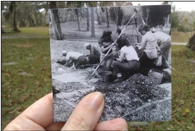
Sometimes the only traces archaeologists leave of their work are pictures.

As part of its celebrations for Florida Archaeology Month, the Florida Public Archaeology Network (FPAN) and the Friends of Crystal River State Park are putting together a new photo exhibit at the Crystal River Archaeological State Park that celebrates the history and archaeology of the site through pictures. More specifically, the re-photographs in the exhibit superimpose old pictures on the current landscape to show how things have changed (or stayed the same) over time.