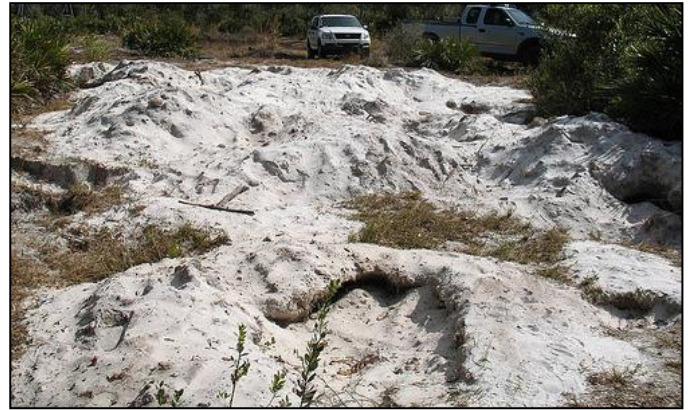
Some of the sites that were involved in the FWC sting operation have been badly damaged and will never be able to be studied by archaeologists in the future.