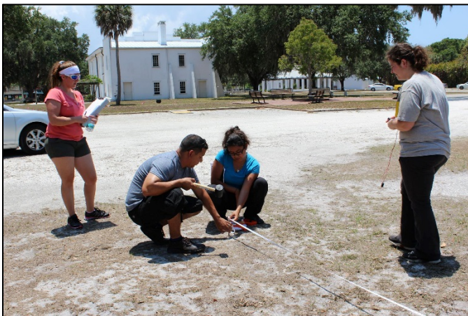
USF archaeology field school students lay out a grid before starting excavations at Gamble Plantation in Ellenton.

The University of South Florida is hosting an archaeology field school at Gamble Plantation Historic State Park from May 15 th through June 23 rd . Excavations are open for public observation every day, from around 9:00am to 2:30pm Monday through Friday (ending at noon on Fridays).