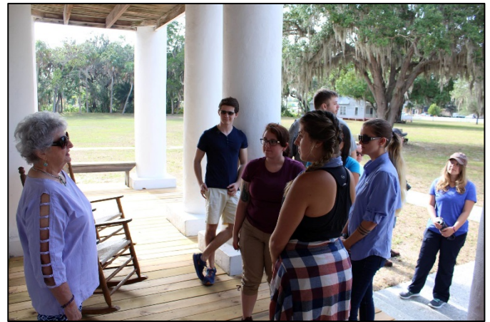
Field school students get a tour of the Gamble mansion before they start their work at the site.

brief lunch break at Noon, the field school will reconvene at 1:00pm for a demonstration of an archaeological method, or a lecture on an archaeological topic. Children are welcome, as they will have activities for all ages!