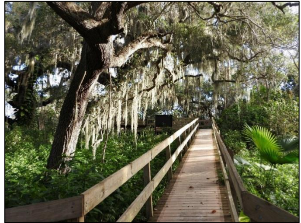
View up to the top of the Portavant Mound at Emerson Point Preserve.

WHEN: Sunday, March 19 th at 11am WHERE: Emerson Point Preserve 5801 17th St W, Palmetto, FL