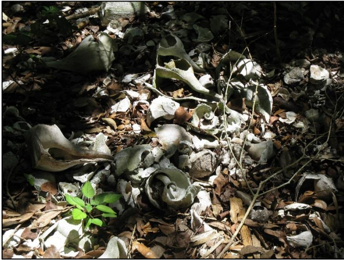
Whelk shells litter the ground near the Portavant Mound at Emerson Point Preserve.