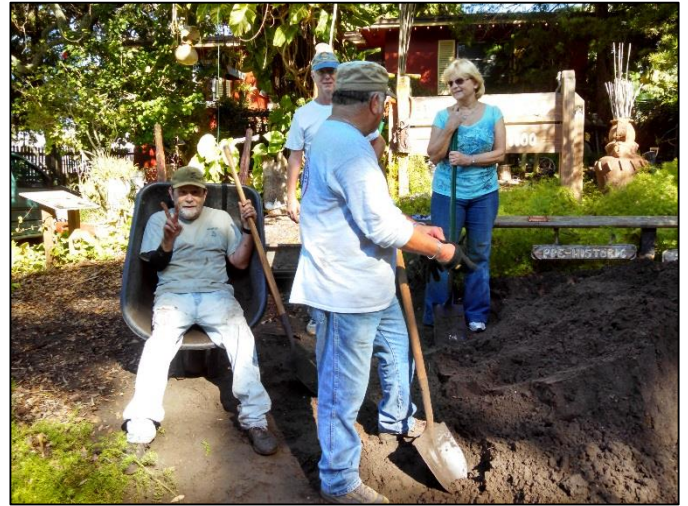
Getting started moving some dirt!