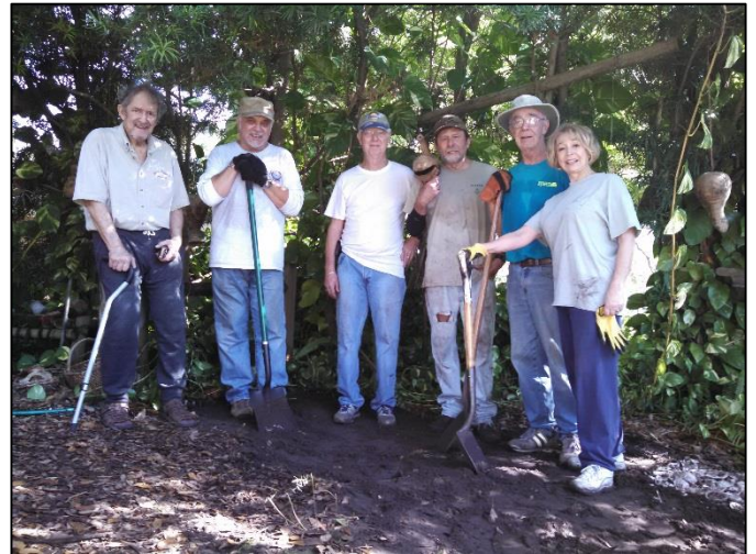
Thanks so much to everyone who came out!